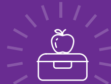
Free breakfast and lunch